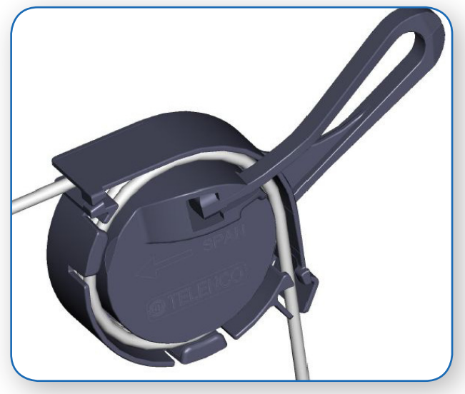
Cable installed (3 rolls) Bail locked

Tel: +33 (0) 476 350 015 Fax: +33 (0) 476 350 179