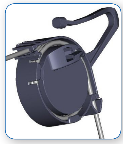
Cable installed (3 rolls) Bail not locked